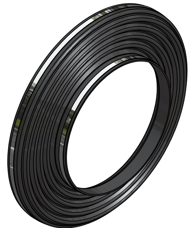
Tolerances for backing flanges and flow liners on basis of DIN EN 1092-1